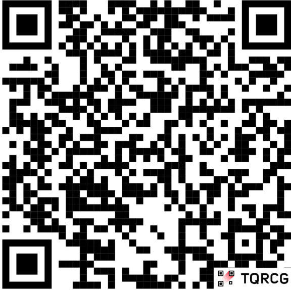
Academic Calendar QR Code